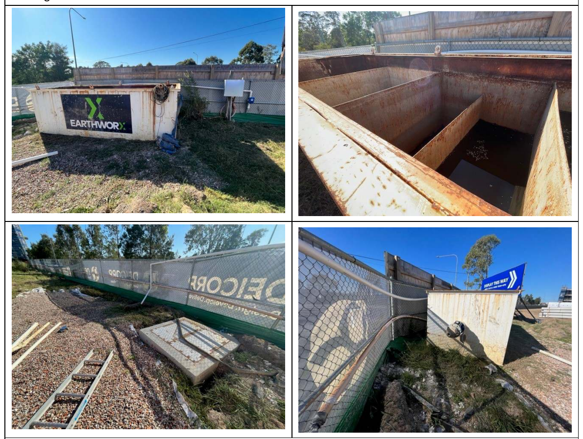
Photos 9-12: Sediment basin, SE corner of Site 2. Rubbish recommended for removal, as well stabilisation and seeding of the disturbed batter. Discharge controls in place.