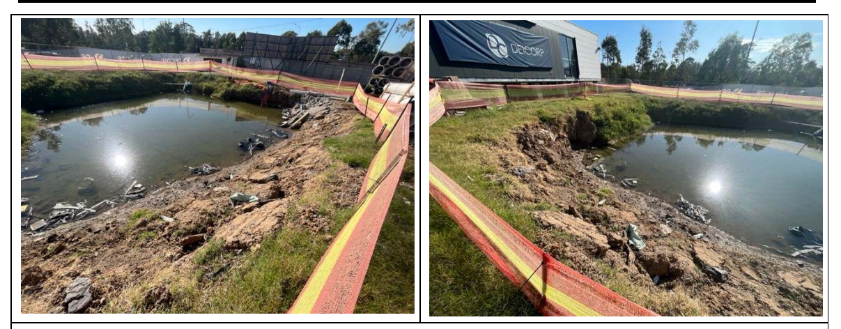
Photos 7 & 8: Sediment basin, SE corner of Site 2. Rubbish recommended for removal, as well stabilisation and seeding of the disturbed batter.